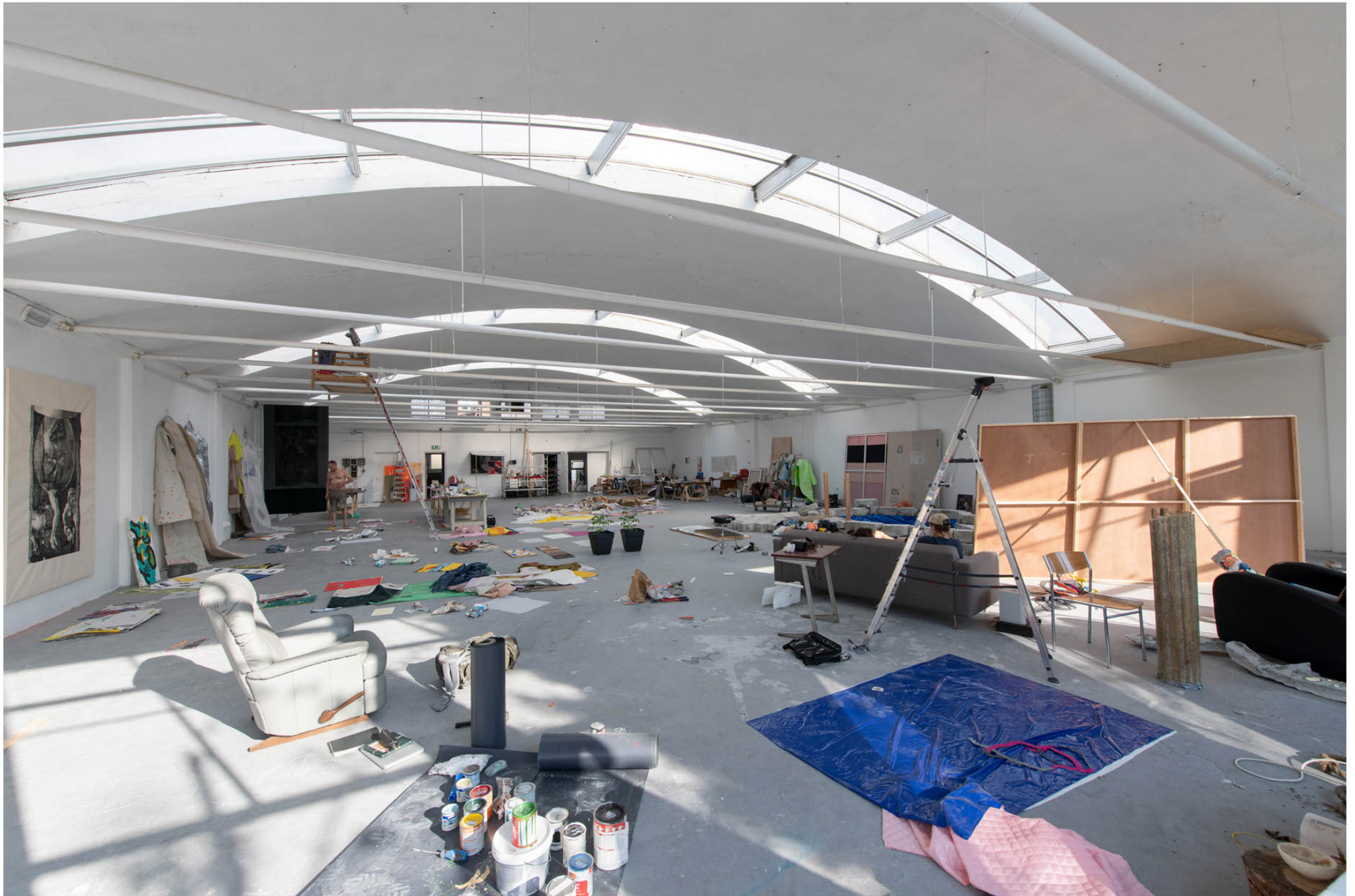
It is part XVIII and I'm here to be part of the assembly, and this assembly is no longer necessarily ceremonial, 2020 studio