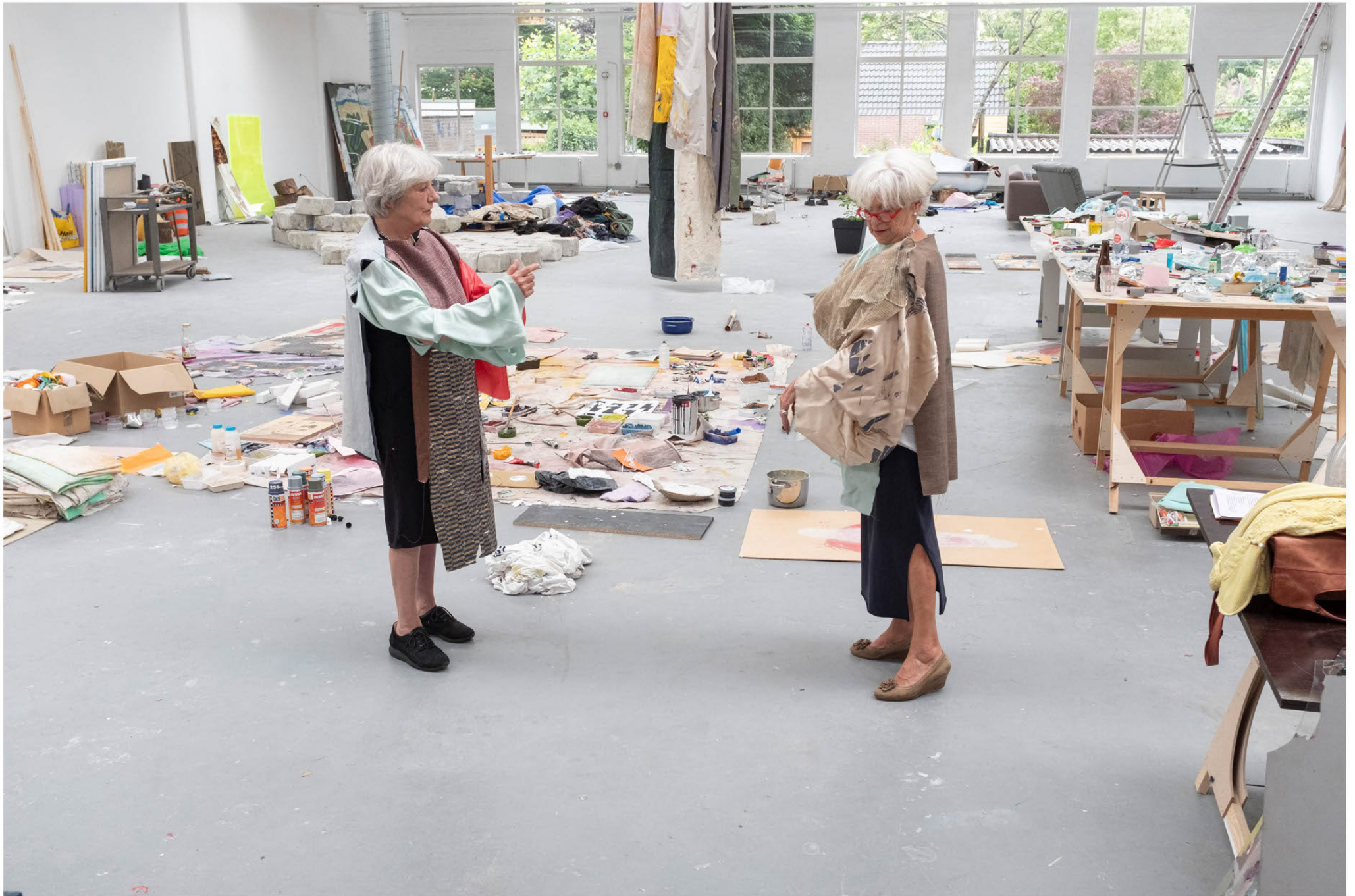
It is part XVIII and I'm here to be part of the assembly, and this assembly is no longer necessarily ceremonial, 2020 studio