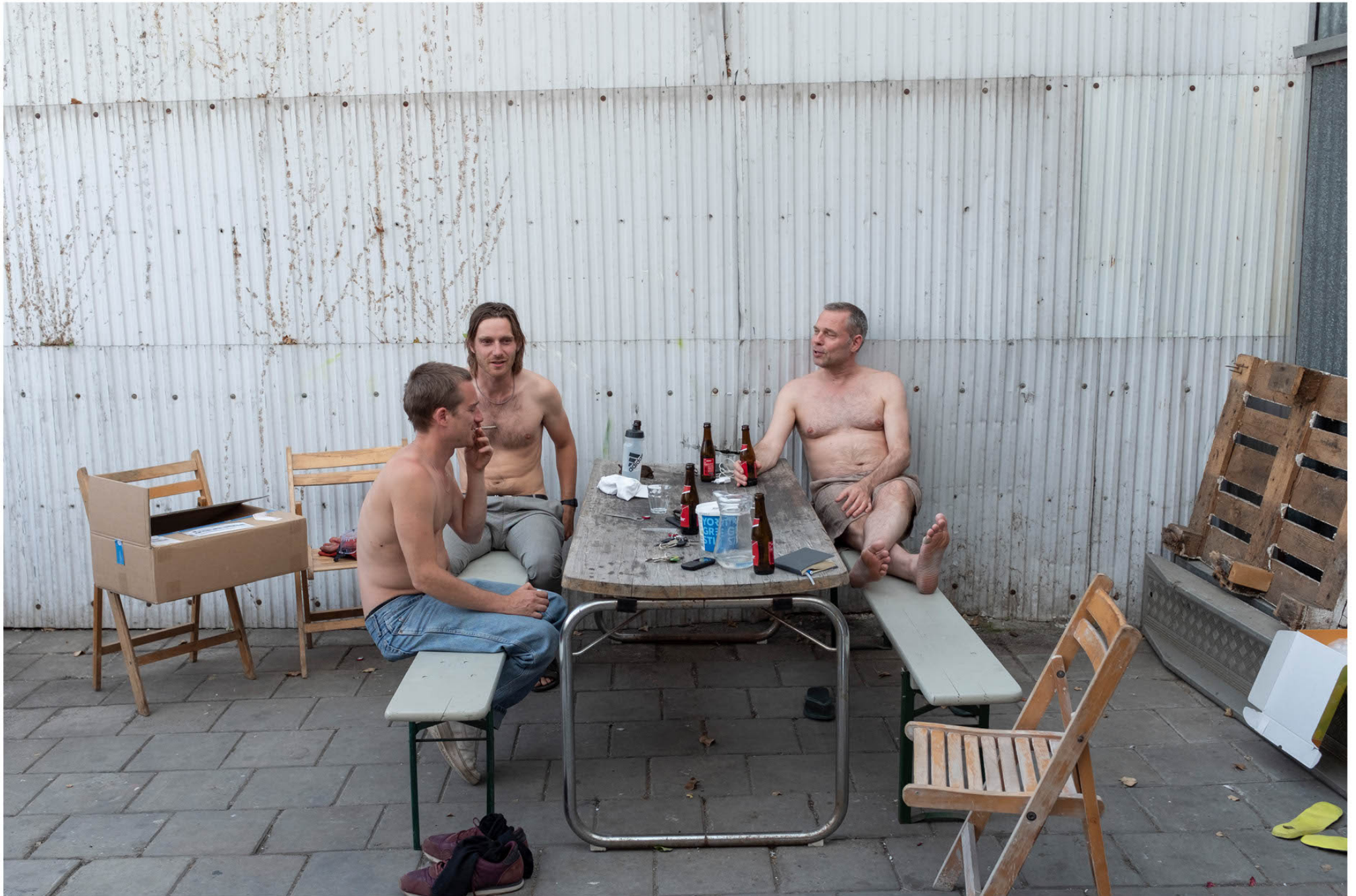
It is part XVIII and I'm here to be part of the assembly, and this assembly is no longer necessarily ceremonial, 2020 studio