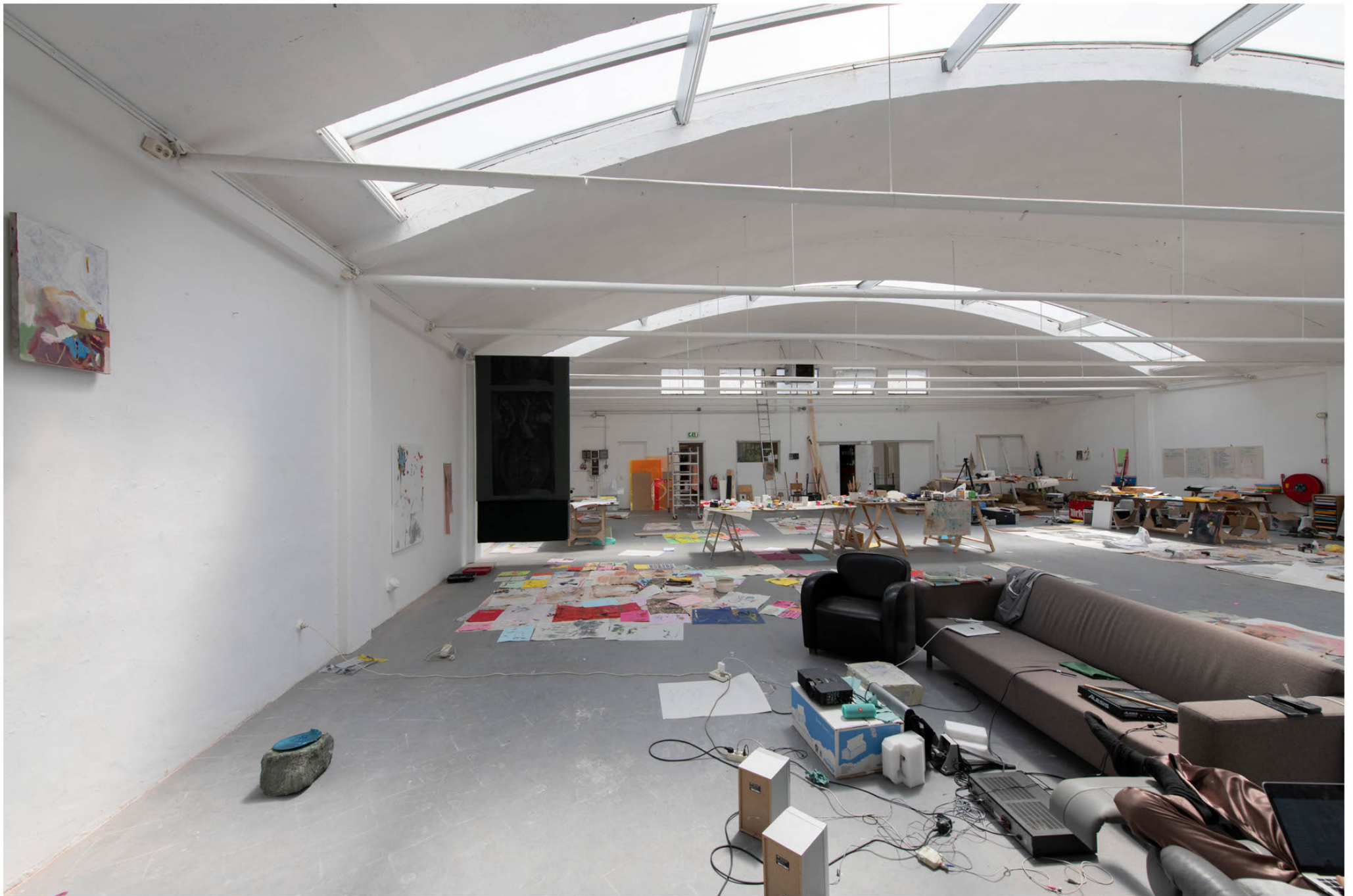
It is part XVIII and I'm here to be part of the assembly, and this assembly is no longer necessarily ceremonial, 2020 studio