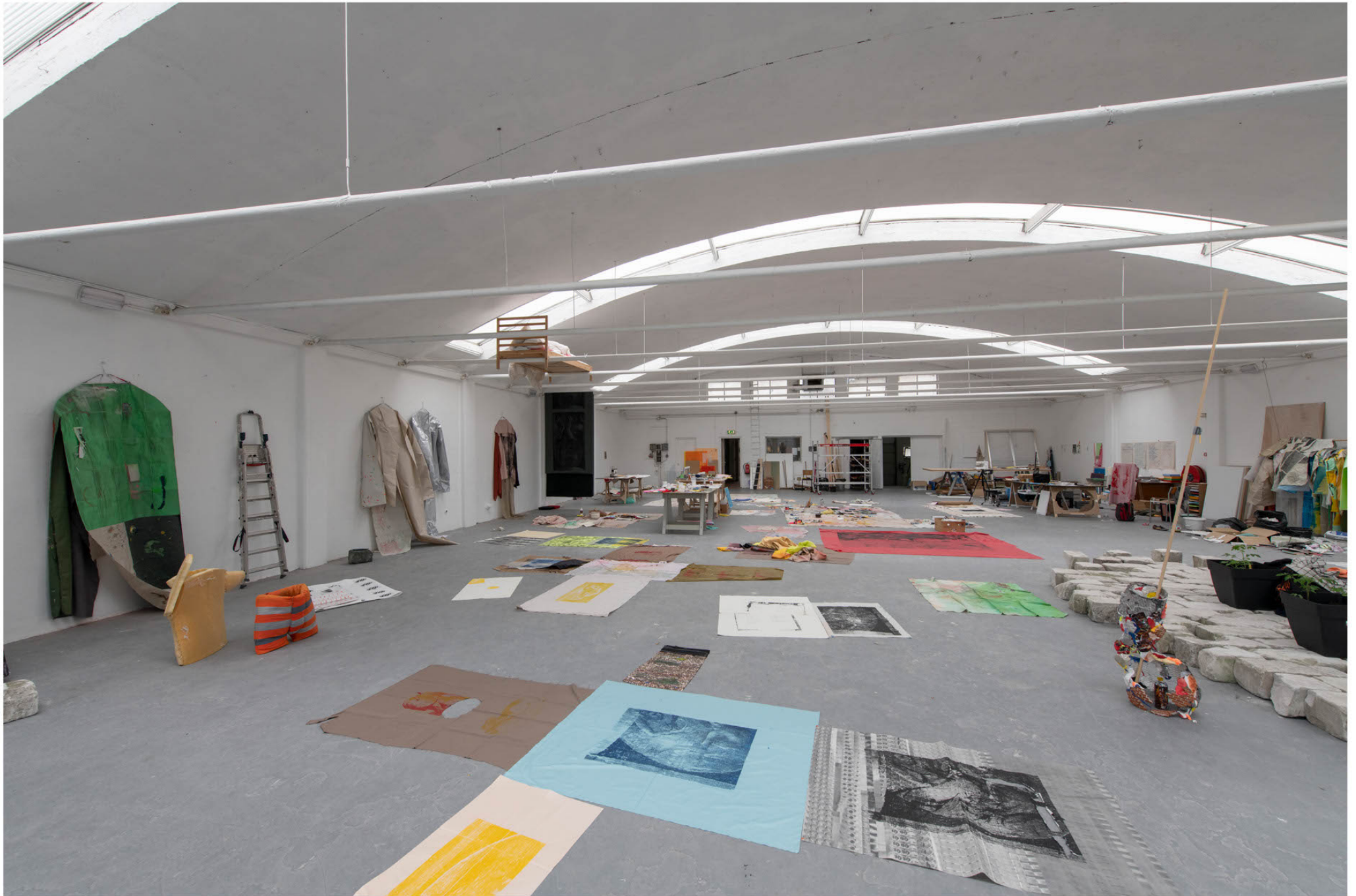
It is part XVIII and I'm here to be part of the assembly, and this assembly is no longer necessarily ceremonial, 2020 studio