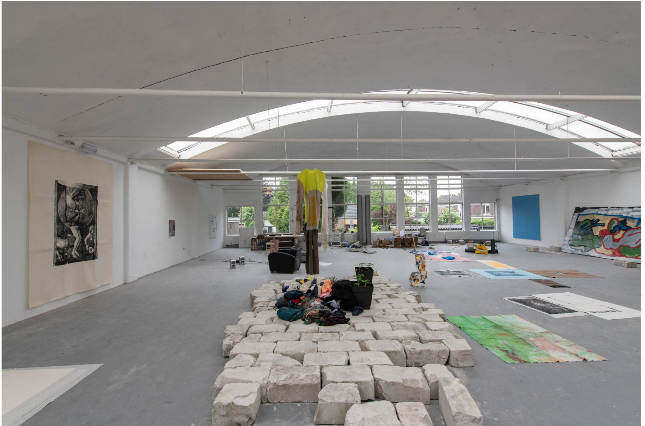
It is part XVIII and I'm here to be part of the assembly, and this assembly is no longer necessarily ceremonial, 2020 studio