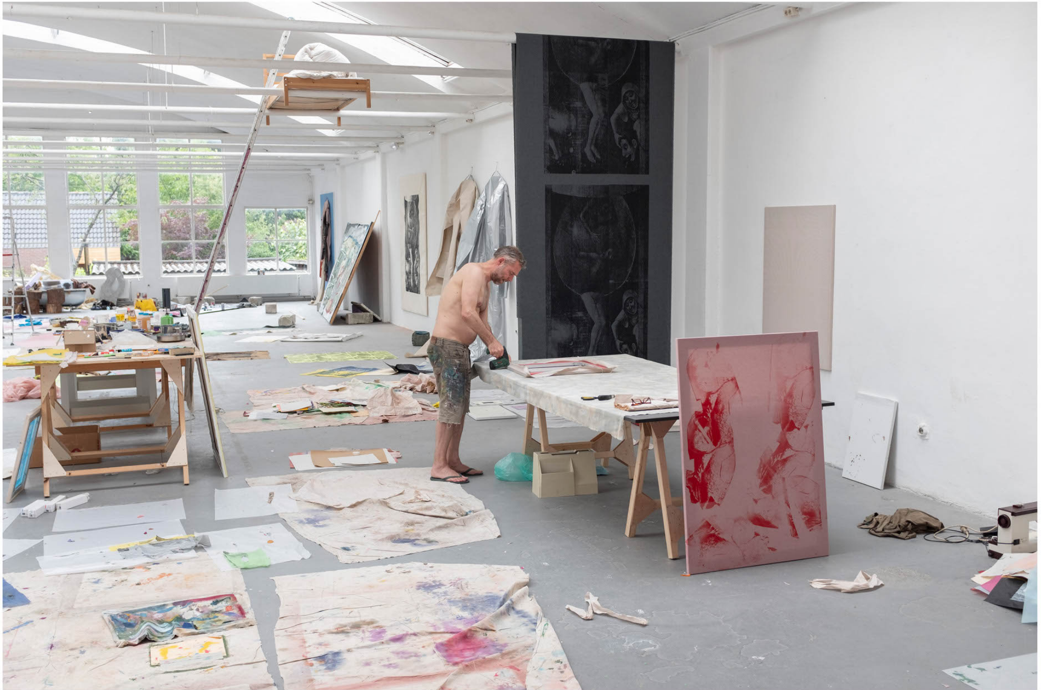
It is part XVIII and I'm here to be part of the assembly, and this assembly is no longer necessarily ceremonial, 2020 studio