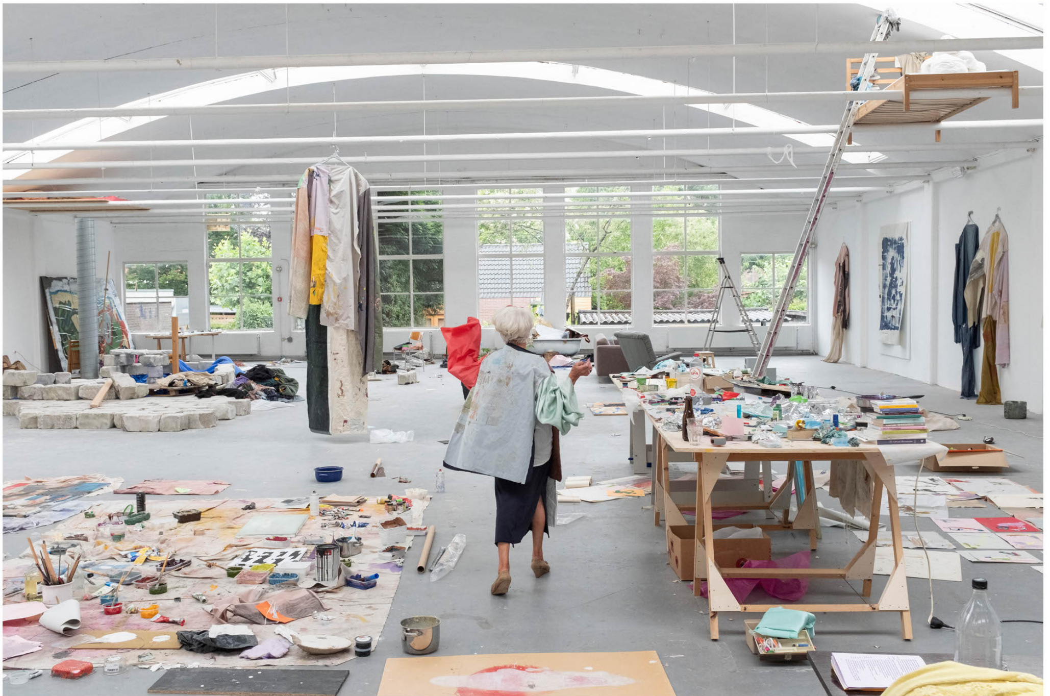
It is part XVIII and I'm here to be part of the assembly, and this assembly is no longer necessarily ceremonial, 2020 studio