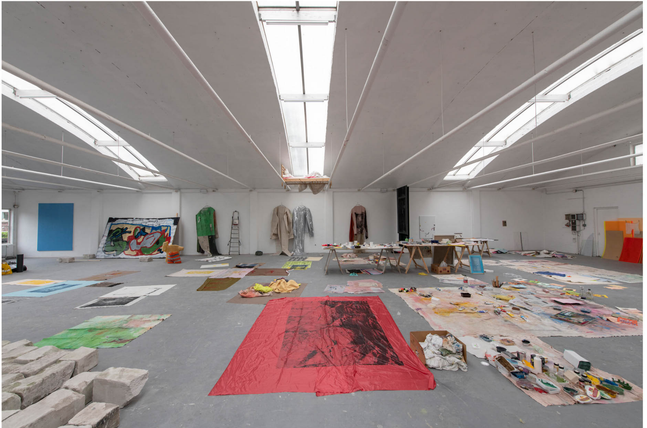
It is part XVIII and I'm here to be part of the assembly, and this assembly is no longer necessarily ceremonial, 2020 studio