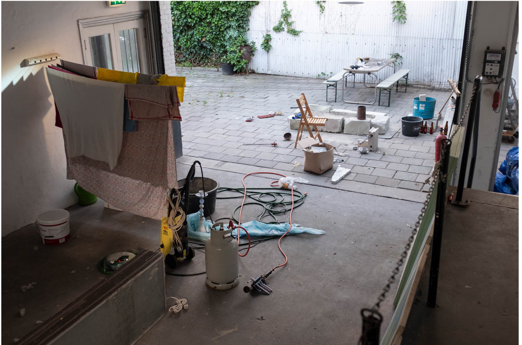
It is part XVIII and I'm here to be part of the assembly, and this assembly is no longer necessarily ceremonial, 2020 studio