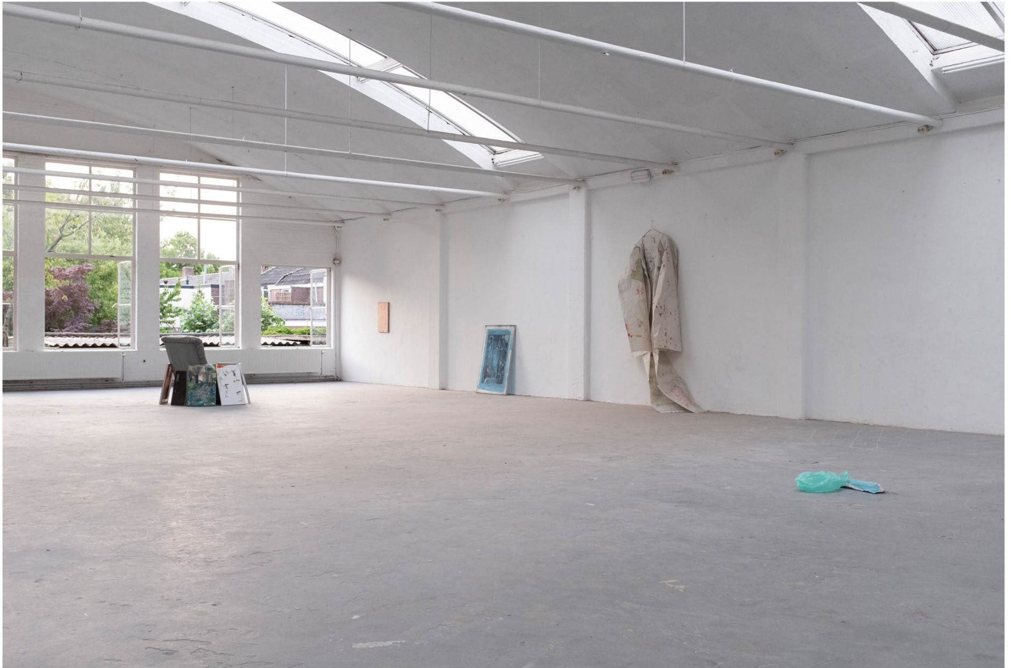
It is part XVIII and I'm here to be part of the assembly, and this assembly is no longer necessarily ceremonial, 2020 studio