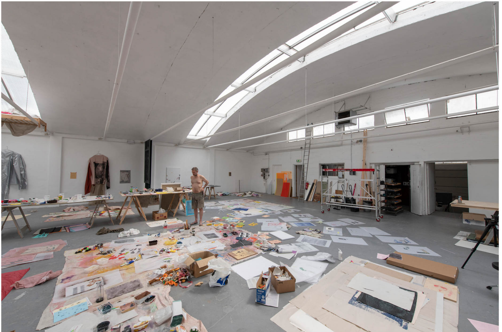
It is part XVIII and I'm here to be part of the assembly, and this assembly is no longer necessarily ceremonial, 2020 studio