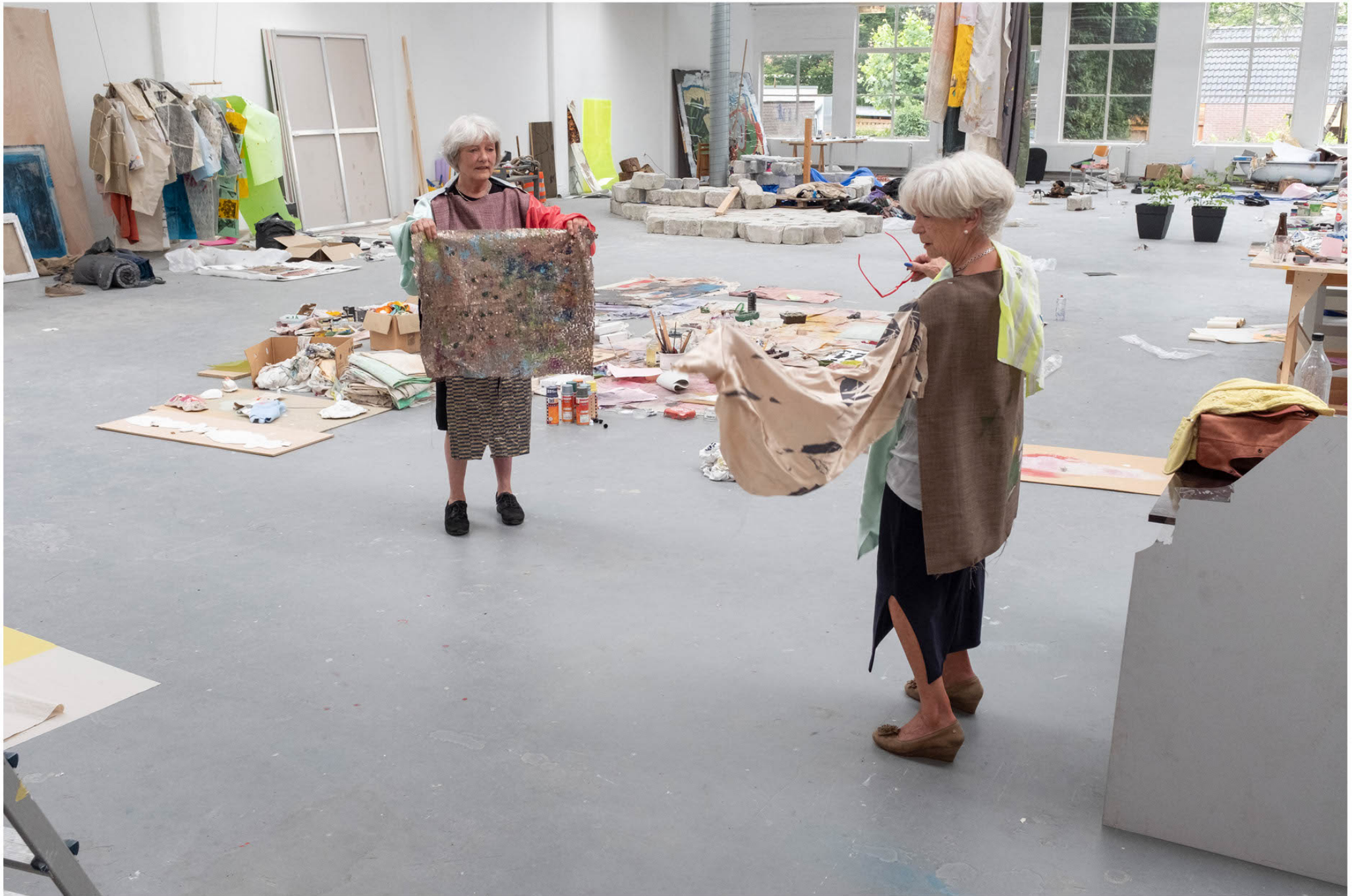
It is part XVIII and I'm here to be part of the assembly, and this assembly is no longer necessarily ceremonial, 2020 studio