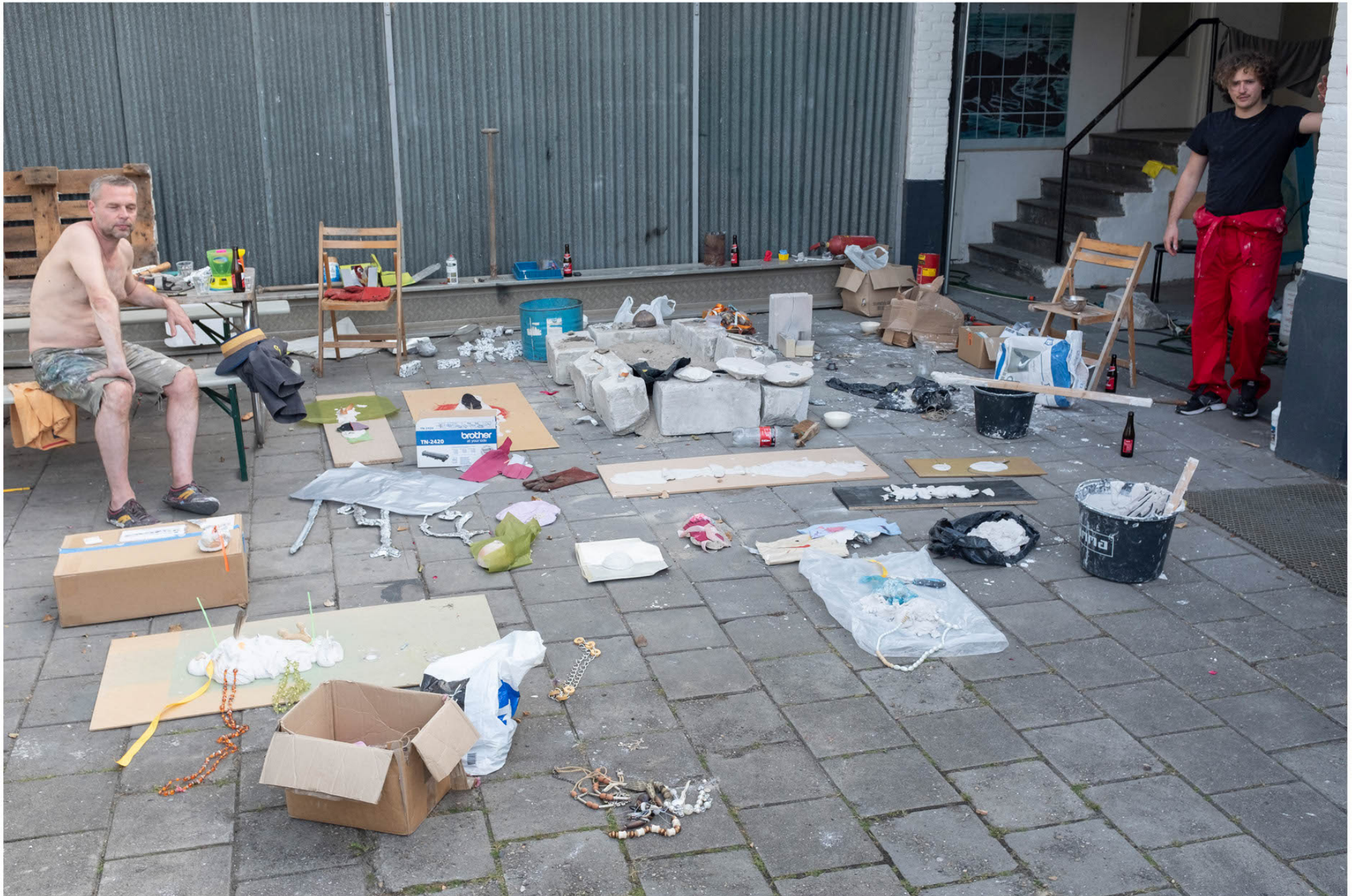
It is part XVIII and I'm here to be part of the assembly, and this assembly is no longer necessarily ceremonial, 2020 studio