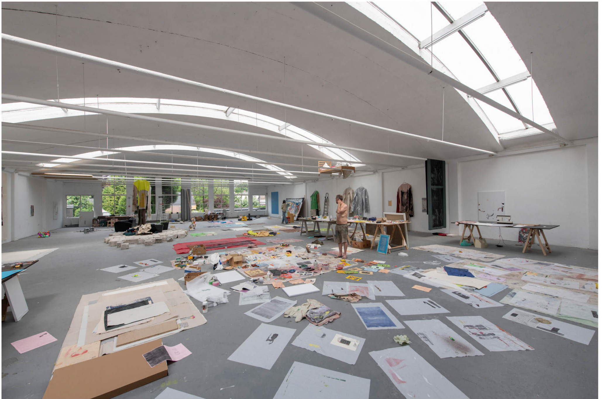
It is part XVIII and I'm here to be part of the assembly, and this assembly is no longer necessarily ceremonial, 2020 studio