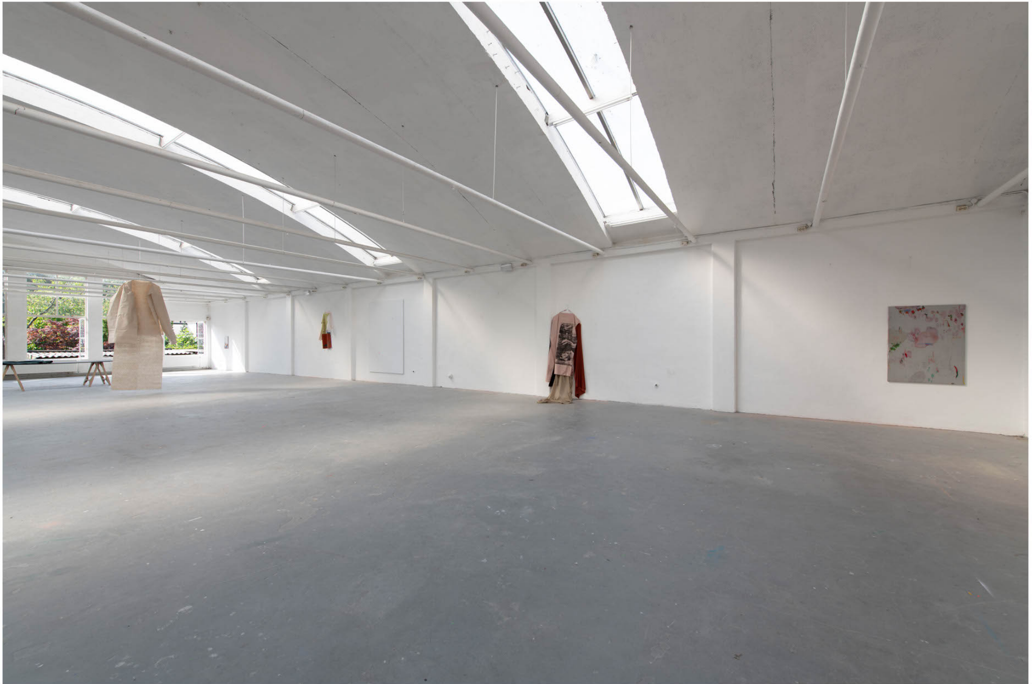
It is part XVIII and I'm here to be part of the assembly, and this assembly is no longer necessarily ceremonial, 2020 studio