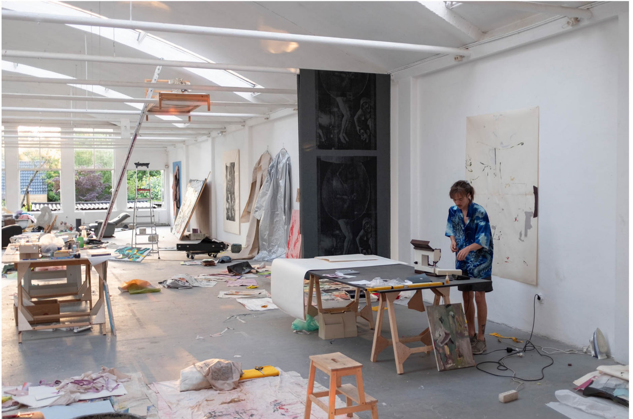
It is part XVIII and I'm here to be part of the assembly, and this assembly is no longer necessarily ceremonial, 2020 studio