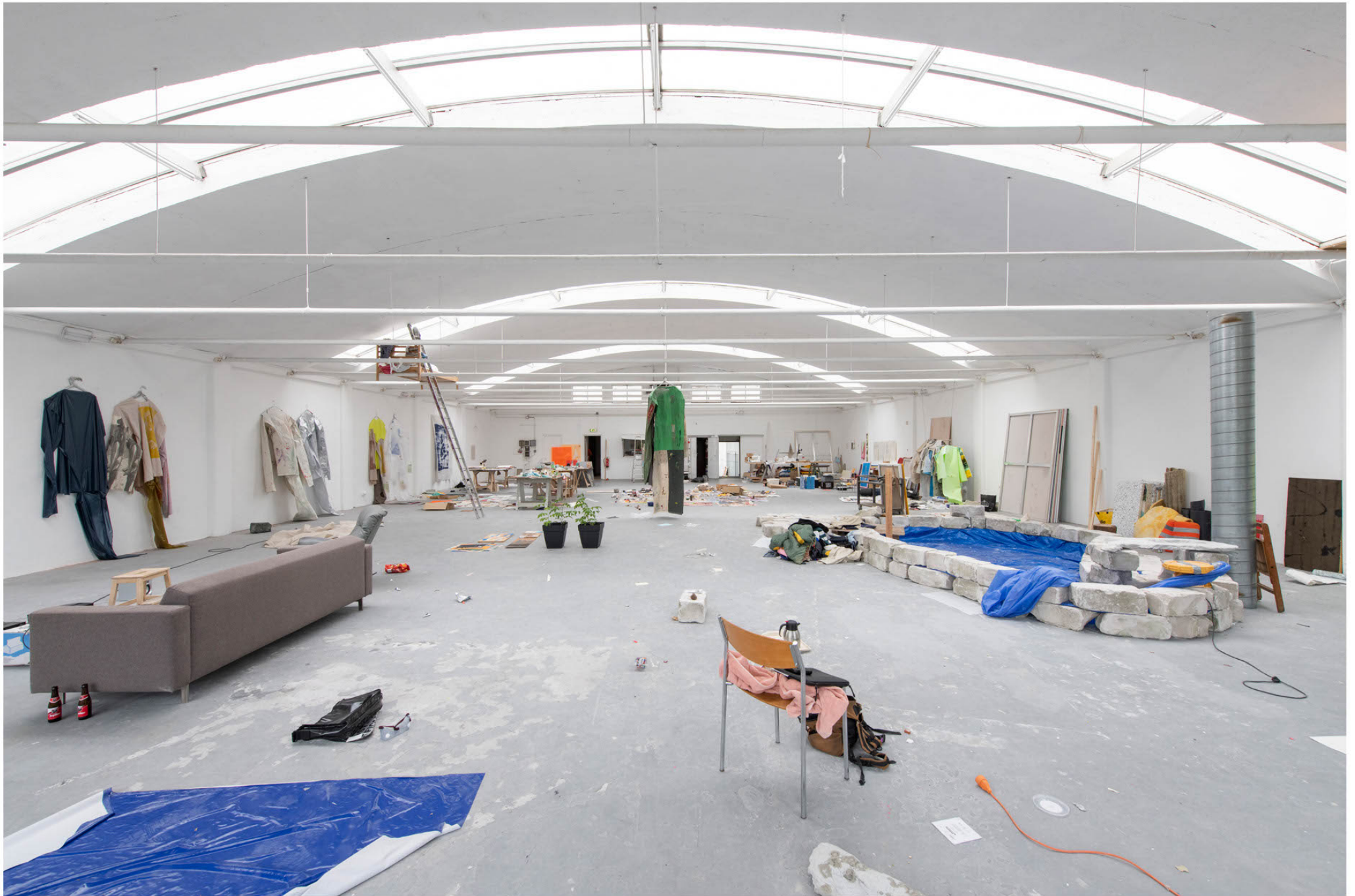
It is part XVIII and I'm here to be part of the assembly, and this assembly is no longer necessarily ceremonial, 2020 studio