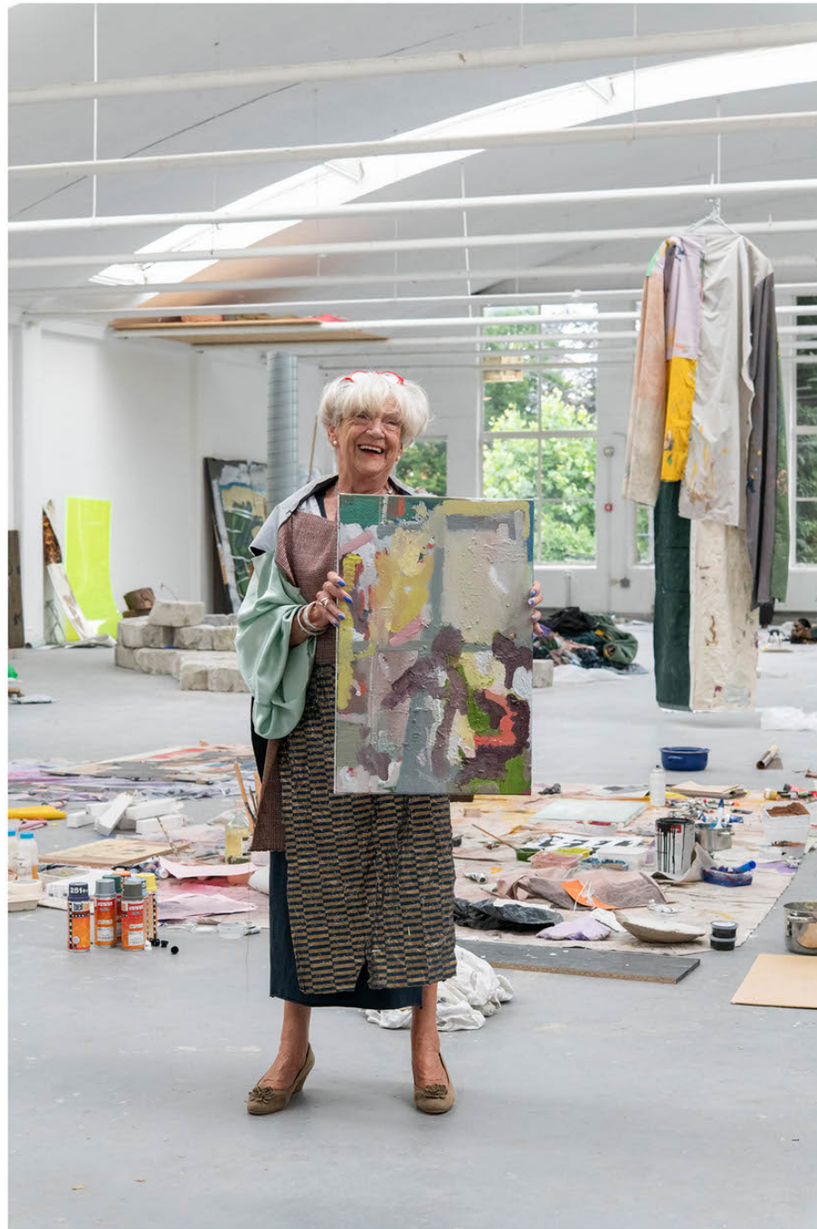
It is part XVIII and I'm here to be part of the assembly, and this assembly is no longer necessarily ceremonial, 2020 studio