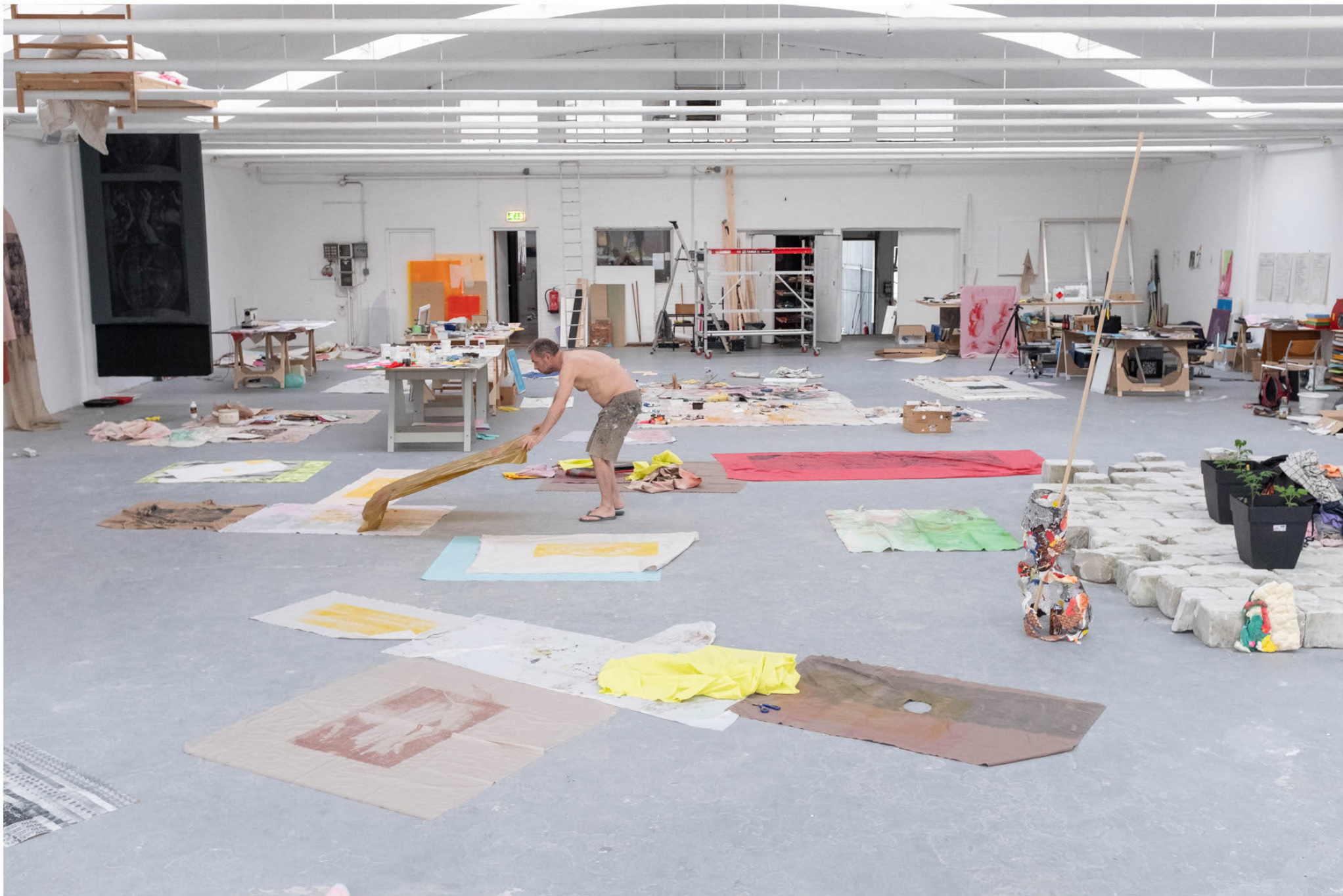
It is part XVIII and I'm here to be part of the assembly, and this assembly is no longer necessarily ceremonial, 2020 studio